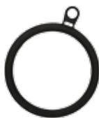
Scrim Adapter (10 04 64) Black