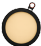
3200K Dichro Color Filter. Changes a Daylight color temperature (5600K) to 3200K Tungsten. Red