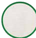
Full Single Scrim, will reduce the entire light surface by f ½ stop