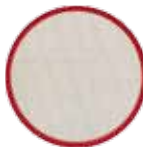
Full Double Scrim, will reduce the entire light surface by f 1 stop