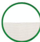
Half Single Scrim, will reduce the half part of the light surface by f ½ stop