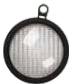
Wide Flood Lens (10 04 69) Green This lens provides 60° beam spread