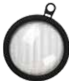
Medium Flood Lens (10 04 68) Black This lens provides 20° beam spread