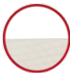
Half Double Scrim, will reduce the half part of the light surface by f 1 stop