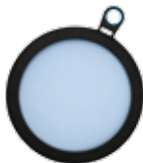
5500K Dichro Color Filter. Changes a Tungsten color temperature (3200K) to 5600K Daylight. Blue