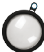
Narrow Spot Lens (10 04 67) Blue This lens provides 9° beam spread