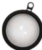
Fresnel Lens (10 04 65) Grey 44° beam of angle with PAR insert. It will provide a 71° beam at Open face position.