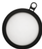
Diffusion Filter (10 04 75) Grey Provides extra softnes